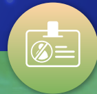
All other risks associated with poor or no identification of mobile users