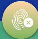
Identity theft through SIM swapping and hacking