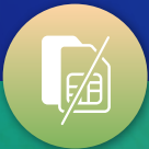
Black market SIMs

Left uncontrolled, however, the SIM market leads to a number of abuses and security issues that affect consumers as well as the whole mobile ecosystem, including: