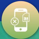
Criminal use of SIMs